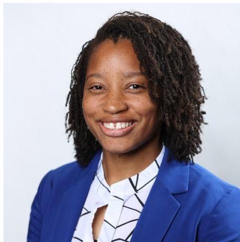
PROVIDING PHYSICAL THERAPY BEHIND BARS