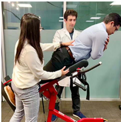
USC SPINE PT FELLOWSHIP GETS ACCREDITATION